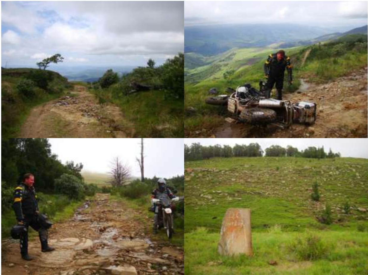
This old marker marks the ox wagon outspan area of the 1800s.

While the going is tough, the scenery is spectacular!